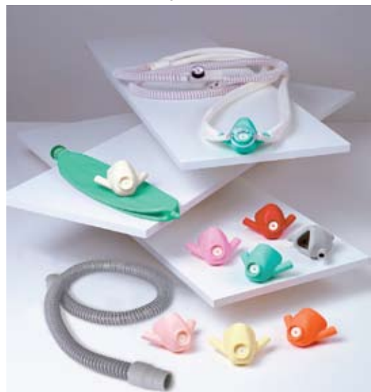
Figure 6. Nasal hoods with scavengers

It is unacceptable and substandard care to use a nasal hood that does not include scavenging.