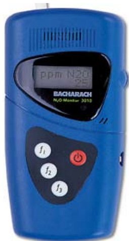
Figure 7. Handheld monitoring device

Handheld monitoring devices can be used to assess the trace levels of nitrous oxide present in the office and the effectiveness of the scavenging.