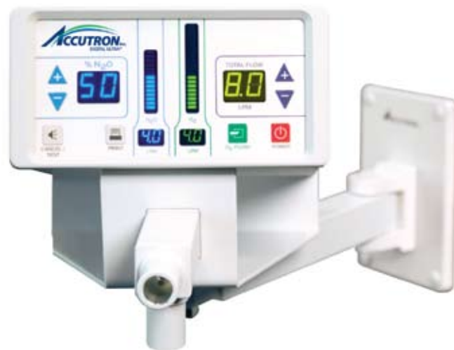
Figure 9. Flowmeter

It is essential if nitrous oxide is administered to pregnant women to ensure an appropriate mix of nitrous oxide and oxygen, as insufficient oxygen can result in spontaneous abortion.