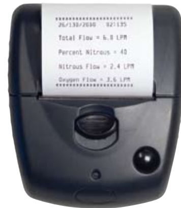
Figure 5. Adjunct print-out device

Scavenging is essential during nitrous oxide/oxygen sedation. It is important that room ventilation and scavenging are adequate to prevent the build-up of nitrous oxide in dental operatories. 29 Nasal hoods contain scavengers that remove exhaled nitrous oxide through a vacuum to the outside world, reducing the possibility of build-up of nitrous oxide in the dental office.