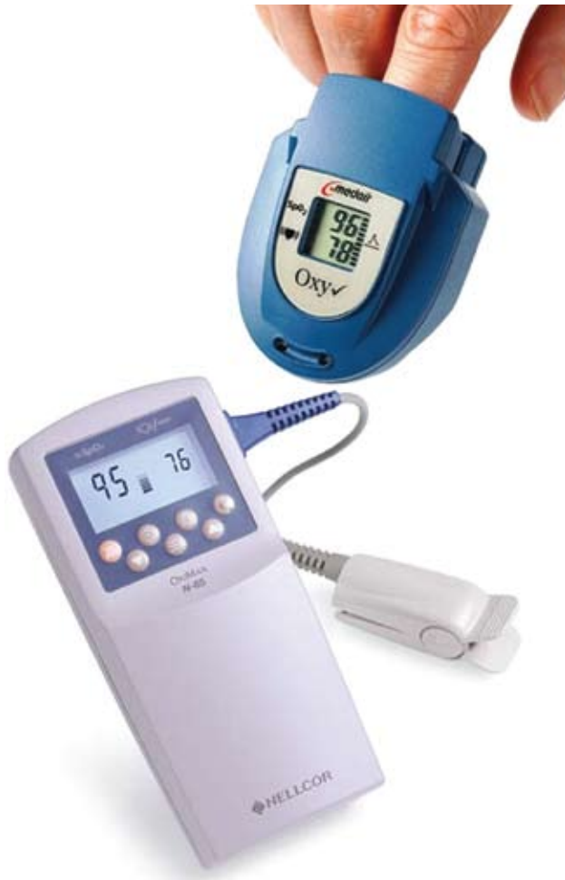
Figure 10. Pulse oximeters

For all patients receiving moderate sedation (more than 50% nitrous oxide), the use of a pulse oximeter to measure the concentration of oxygen in the blood is required in accordance with the guidelines of the ASA Practice Guidelines for Non-Anesthesiologists. Following completion of the procedure and upon cessation of nitrous oxide administration, the patient should receive 100% oxygen for three to five minutes or longer if necessary until the patient experiences no abnormal sensations. At that time, the patient can leave the dental office in a relaxed manner, after an experience that was more pleasant than would have been possible without the use of nitrous oxide/oxygen sedation.