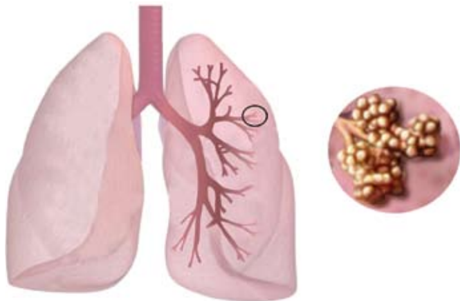
Figure 4. The lungs and alveoli

The fast onset and quick recovery associated with nitrous oxide use are a function of concentration gradients. After nitrous oxide sedation is finished, the nitrous oxide is quickly diffused back into the lungs along with oxygen and other gases. Due to this, oxygen exchange into the lungs and circulation is impaired, which can result in 'Diffusion Hypoxia.' For this reason, patients should receive 100% oxygen for three to five minutes following cessation of nitrous oxide administration to prevent any possibility of hypoxia.